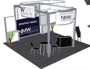
◀ Example of Upgrade Options (Options are different for each exhibition)