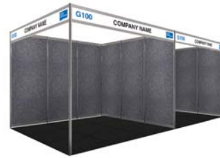
◀ Example of Shell Scheme